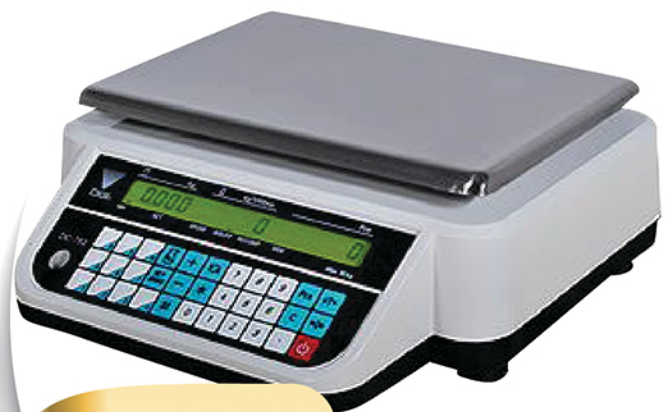
DC - 782