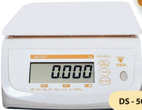
DS - 502

High precision weighting scale with user-friendly features, designed for a variety of applications.