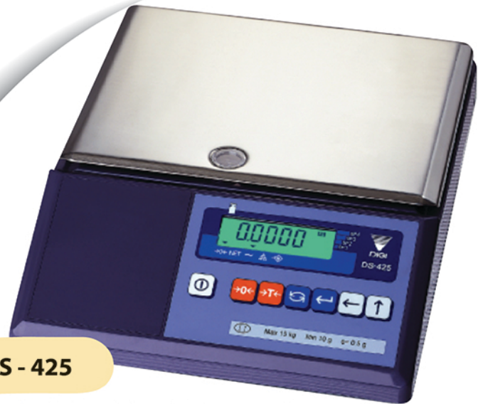
DS - 425