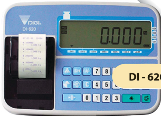
DI - 620