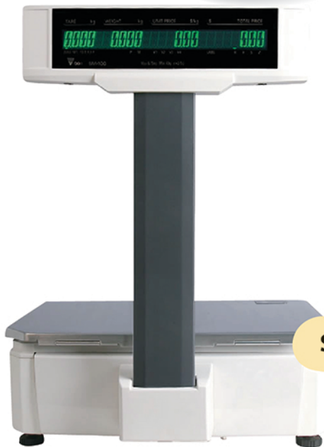
SM - 100

designed for weighing and cash control in the open retail market. Backed by years of experience at DIGI the RM-60 helps your operation by delivering superb value!