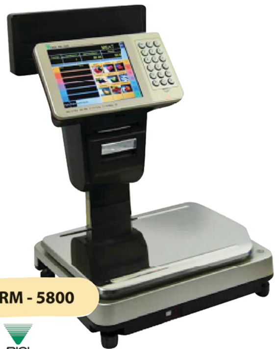
RM - 5800

WEB-2801 is a compact, all-in-one system to improve your checkout operations while minimizing manpower and equipment. A 12-inch touch screen and built-in thermal printer make your daily operations simple and easy. A high-contrast VFD graphic device has been adapted for the customer-side display. MaxPos and MaxChain application systems make it easy to manage various information on a networking basis.