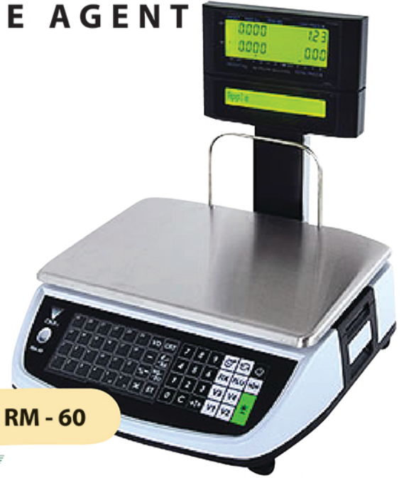
RM - 60

Memory Capacity 2MB (Expandable up to 8MB) Standard Interface RS232C, Ethernet, Cash Drawer control port, AC receptacle