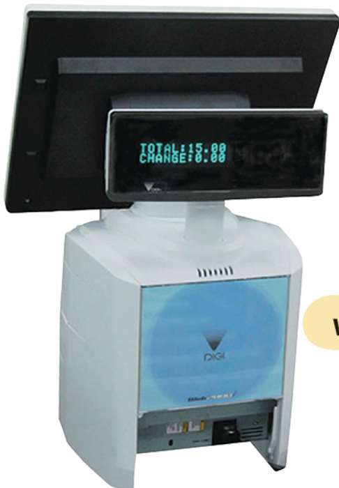
WEB - 2801

The SM-5100 increases throughput of counter transactions with speedy weighing and printing operation. Its robust yet sophisticated appearance looks good on counters in modern stores, providing added value for your store operation.