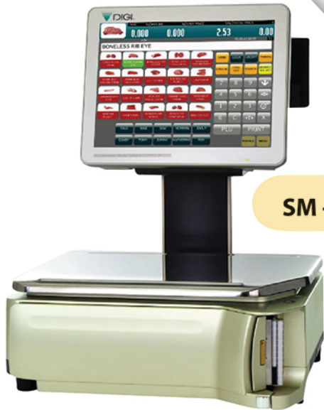
SM - 5500