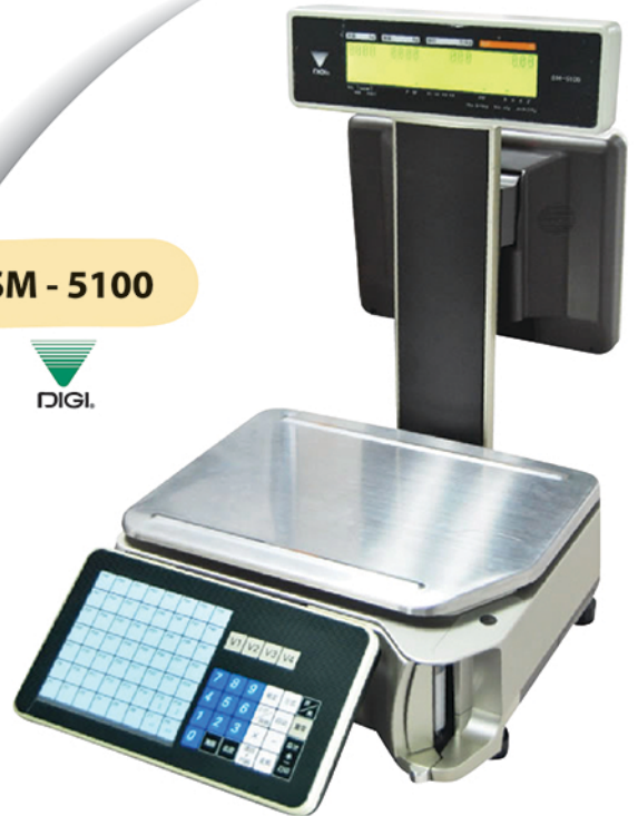
SM - 5100

Boost revenue, manage queues and improve operation throughput with the many innovative functions of the SM-5500 and experience the true retail solution that DIGI PC scales can offer.