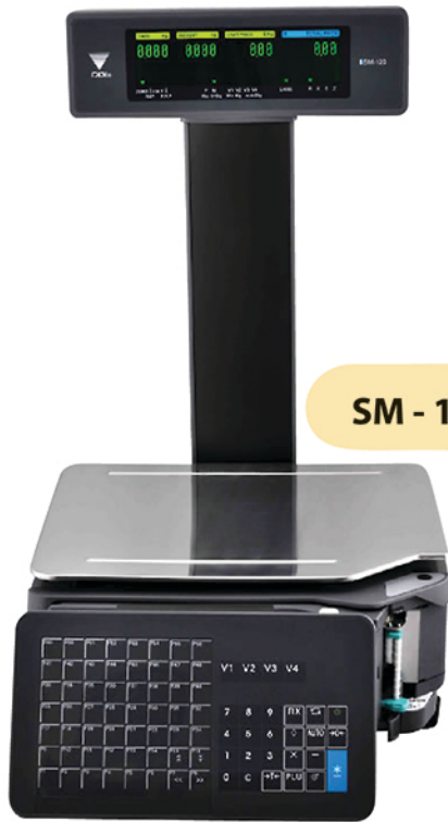
SM - 120