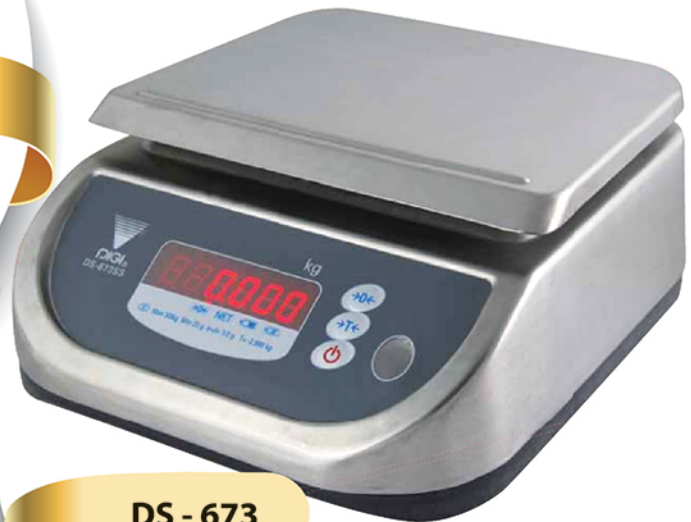
DS - 673